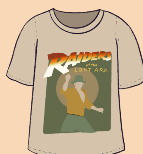
indiana jones tee