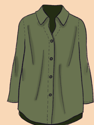
green linen button down