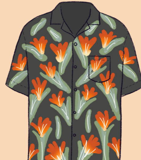
floral hawaiian shirt