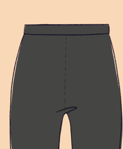
black biker shorts