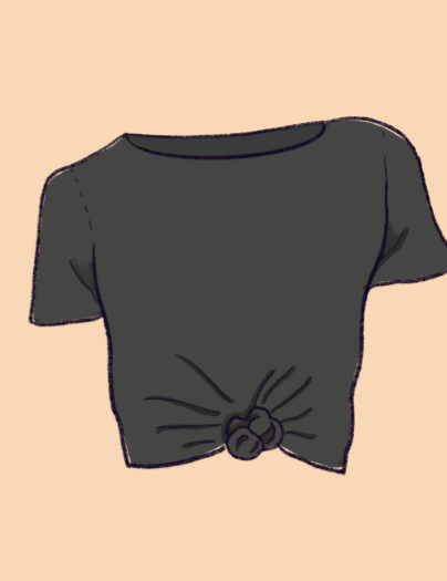
black cropped tee