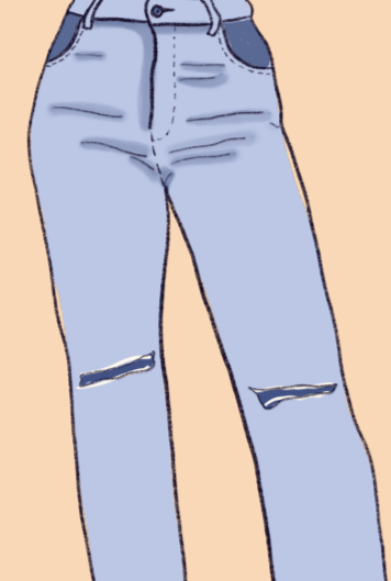
light wash jeans