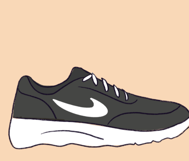
black running shoes