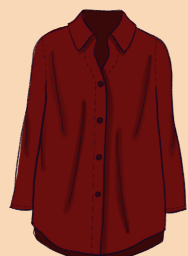
burgundy satin button down