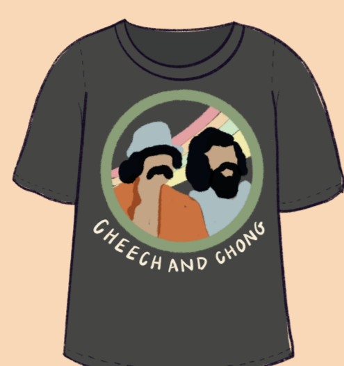
cheech and chong tee