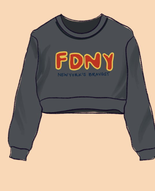
gray cropped crewneck