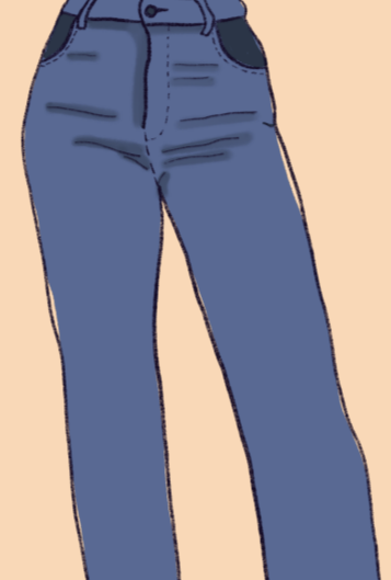
dark wash jeans