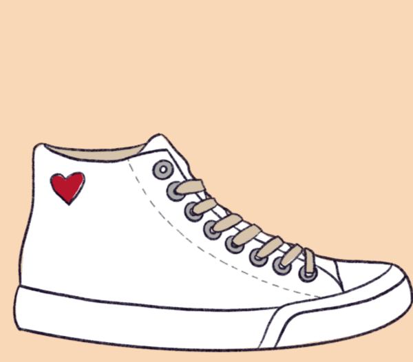
high top white canvas sneakers