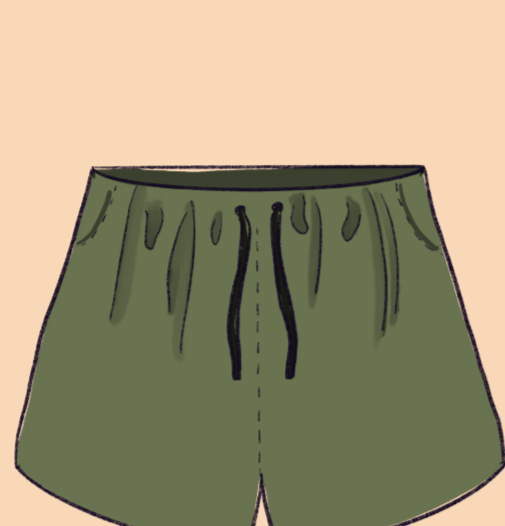
green linen shorts