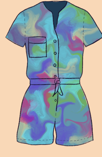
tie dye romper