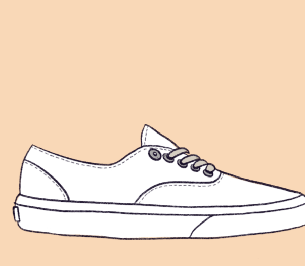
white canvas sneakers