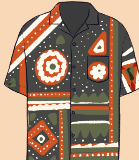
tribal hawaiian shirt