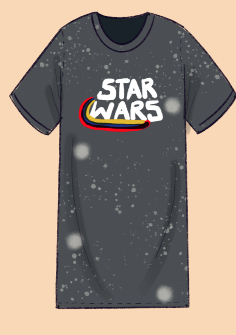
star wars t-shirt dress